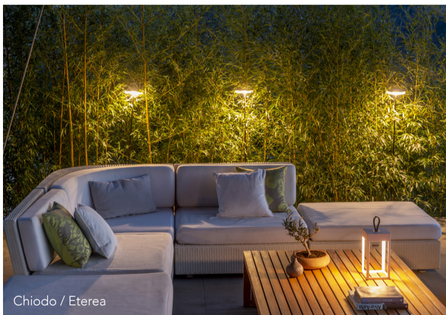
Chiodo / Eterea